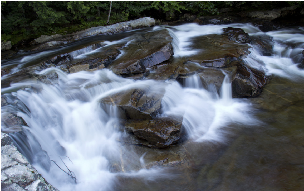
Jackson, New Hampshire

Don't Miss: The drive up Mt. Washington.