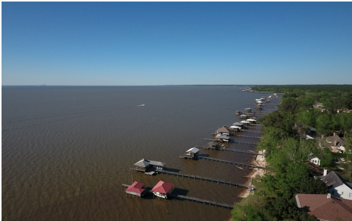
Fairhope/Point Clear, Alabama

Knoll Parks. If you have a sweet tooth, be sure to stop by Punta Clara Kitchen, a decadent candy shop.