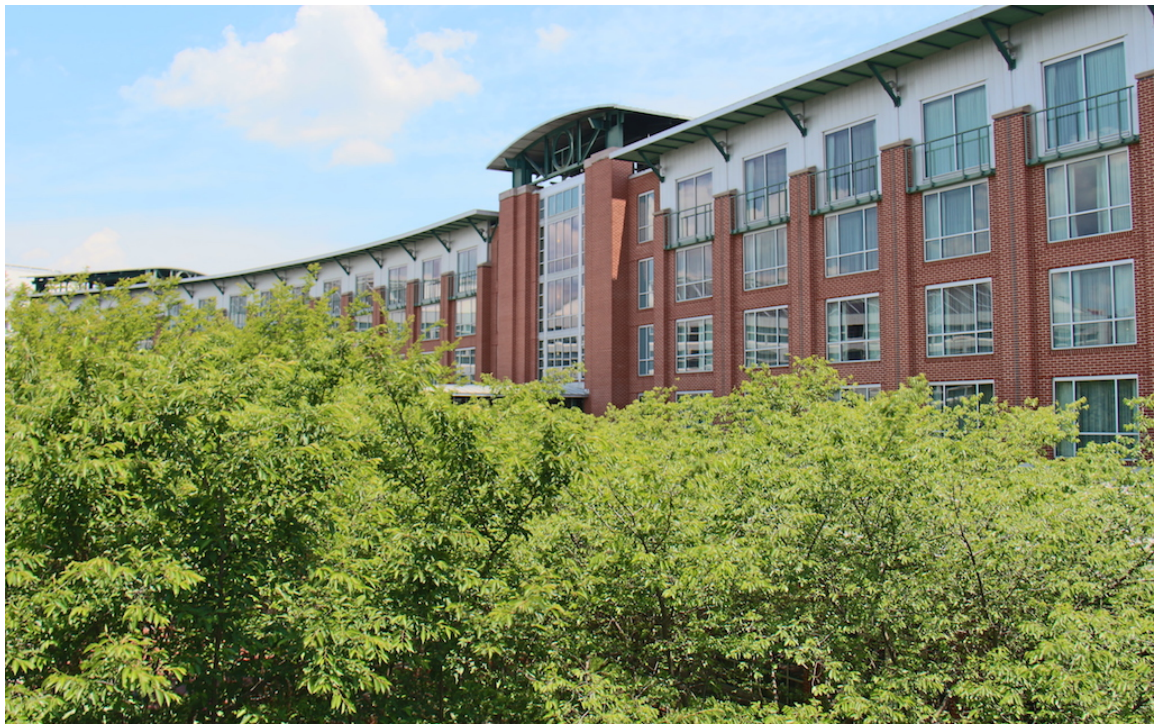
Chattanooga, Tennessee

Don't Miss: Rock City , an amazingly unique botanical garden. The Tennessee Aquarium, one of the best in the country.