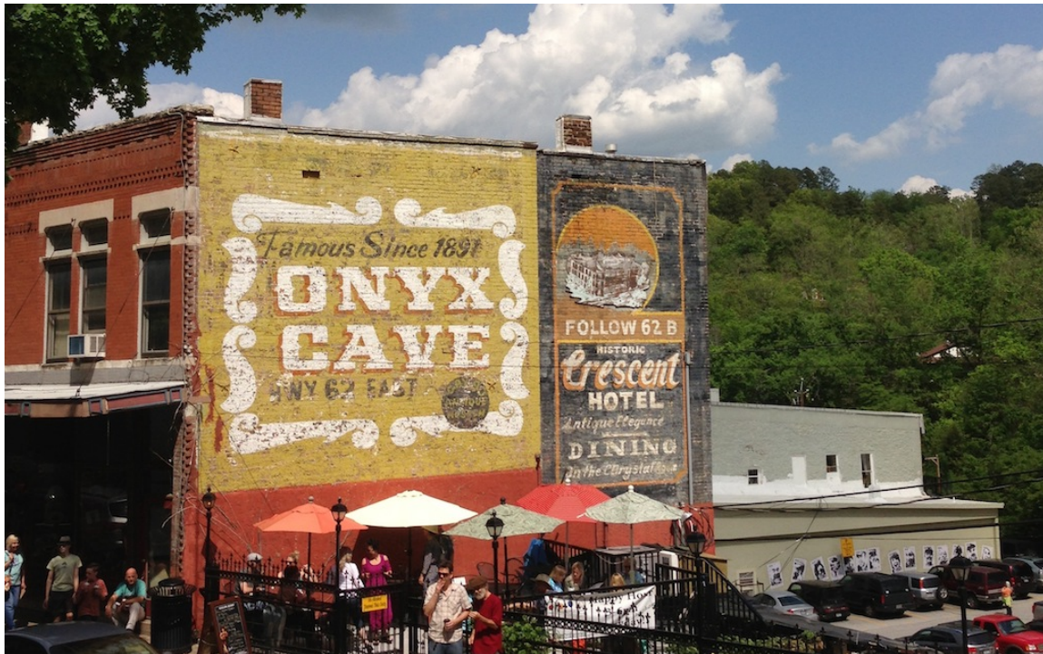
Eureka Springs, Arkansas

Don't Miss: Blue Spring Heritage Center.