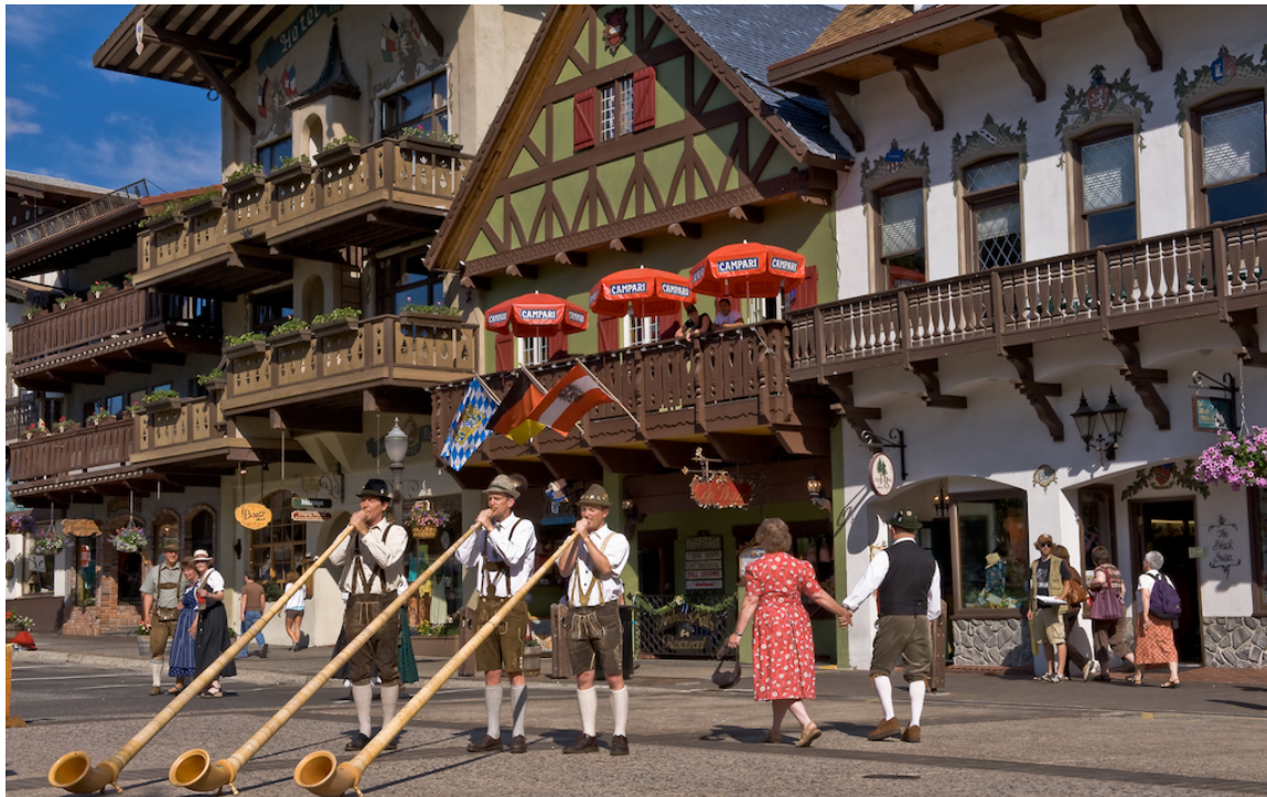
Leavenworth, Washington