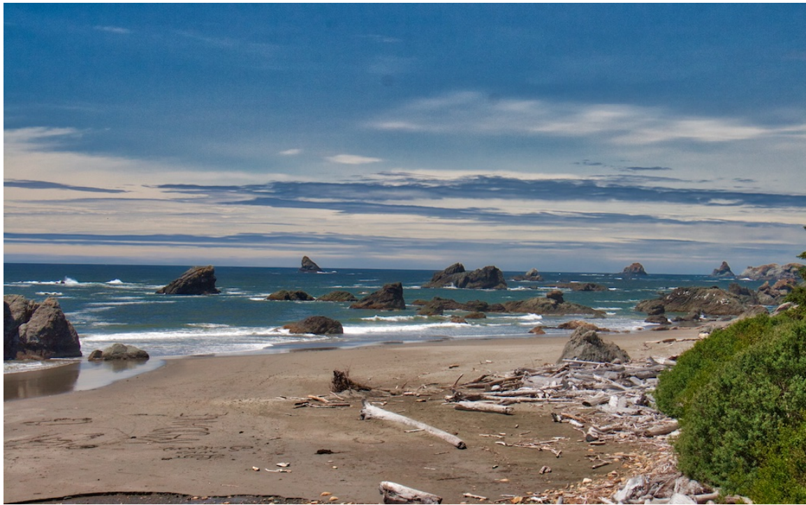
Port Orford, Oregon

Don't Miss: Heads State Park and Humbug Mt. State Park just south of Port Orford.