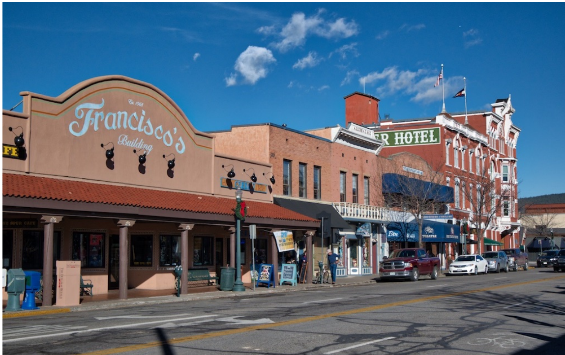
Durango, Colorado

Don't Miss: Riding the rails of the Durango & Silverton Narrow Gauge Train.