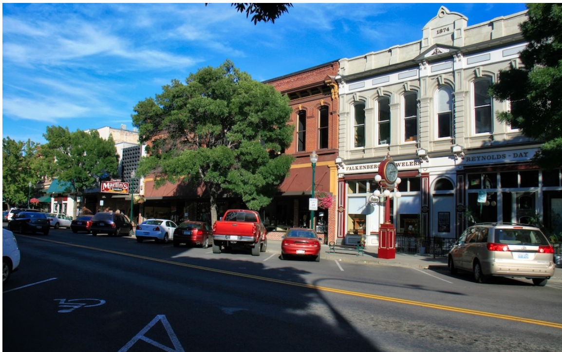
Walla Walla, Washington

Don’t Miss: Wine Tasting! Walla Walla is for wine lovers. Hot air balloon ride.