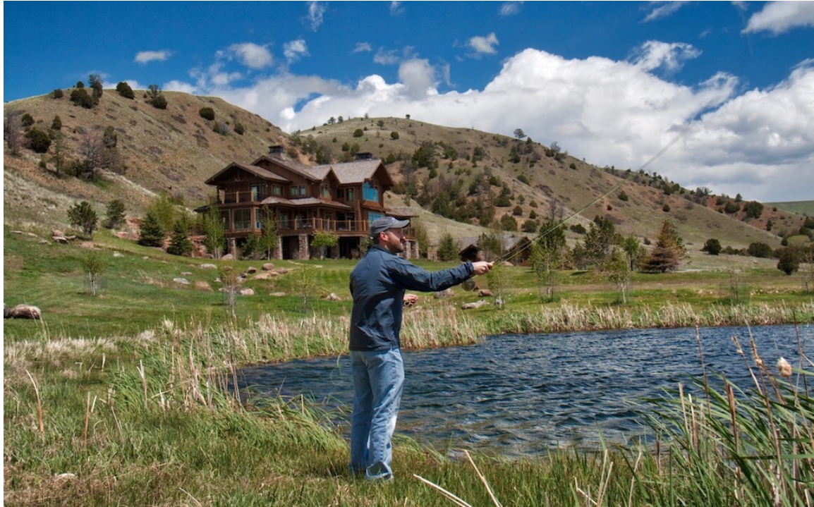
Bozeman, Montana

Don't Miss: Fly Fishing! Or, a hike to an 80-foot thunderous waterfall known as Palisade Falls.