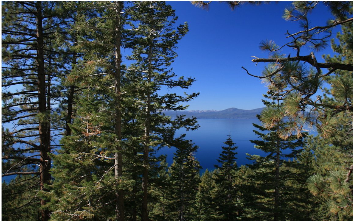
South Lake Tahoe, California

Don't Miss: Driving to Emerald Bay. Historic sights, hikes and stupendous views await along this scenic drive.