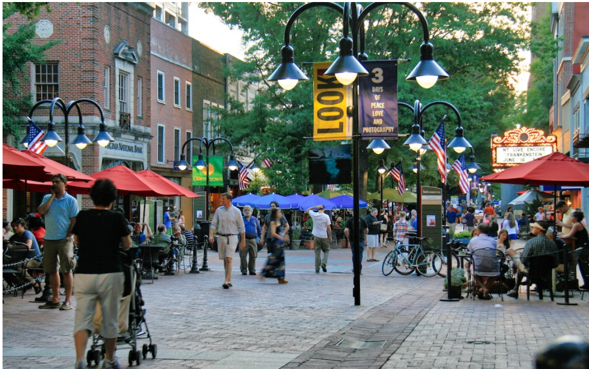
Charlottesville, Virginia

Don't Miss: Monticello – Thomas Jefferson's amazing estate.